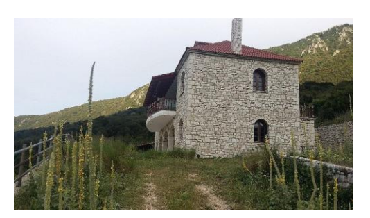
Day 1: Arrival & Installation Once we have settled in the lodgings, we can take a walk in the estate to get to know its facilities but also throughout our stay we have the opportunity to visit the vineyard and the winery as well as to watch and participate in the winemaking process and of course to taste the

unique quality and taste wines that are produced in the Kapotis Estate.